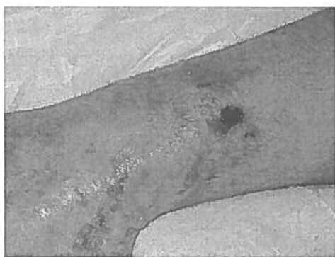
Fig. 2. At day 15 after the burns nearly the whole wound was reepithelialized.

It was postulated that ESW treatment may cause microtrauma and hematoma formation but according to available literature the incidence of shock wave complications varies significantly with the location of treatment and the amount of shock wave energy [7]. As the ESW treatment we applied consisted of 2 series of 1500 impulses at 0.11 \text{ mJ/mm}^2 , which represents a low-dose treatment, we did not encounter any complications.